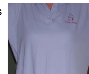
Senior/Rapid Care Workers